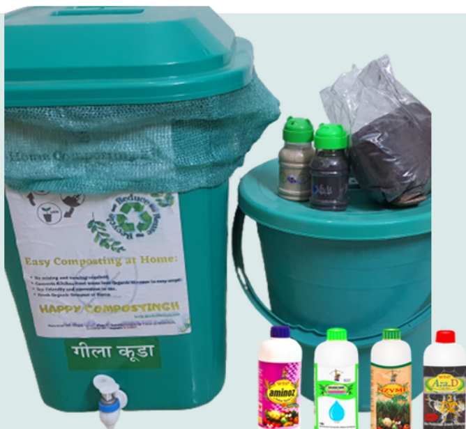
PLANT CARE KIT